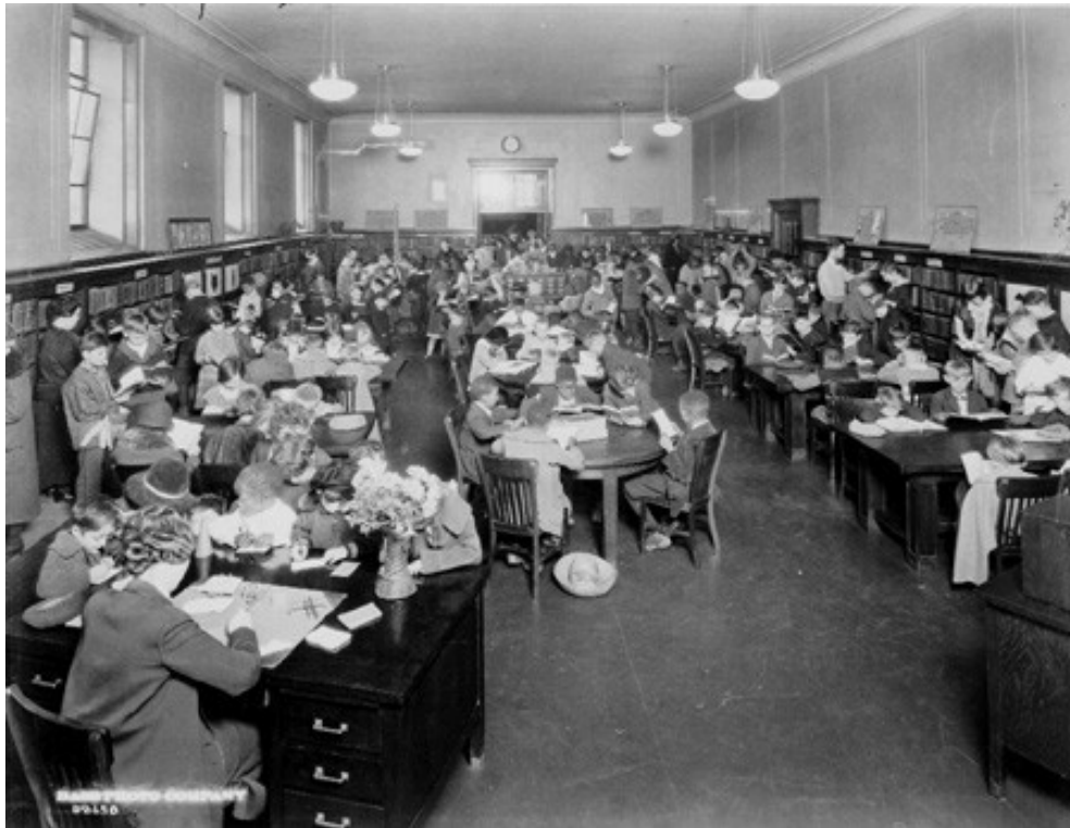
Riley Children's Room 1924

When the old Central Library opened its doors in 1917, the Riley Room for Young People became the center of activity for children and families visiting the Central Library.