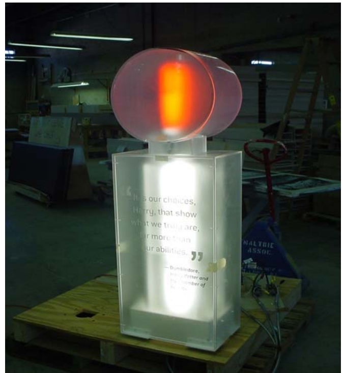
Zone Finder @ The Curve

The Learning Curve @ Central Library is destined to become a favorite place to visit for children and families to the downtown Indianapolis area.