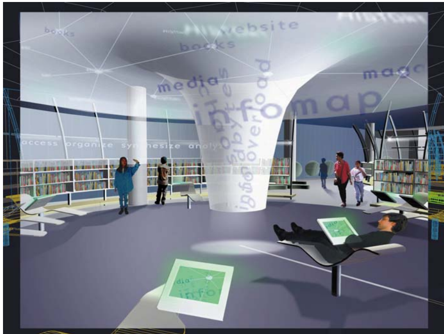
The Vortex @ the Curve

Young people visiting the Learning Curve will be inspired and challenged by hands on activities, group programs, and service projects based on current models for teaching information skills that complement Indiana Educational standards.